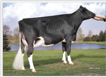
Milbrofar Toro 4099