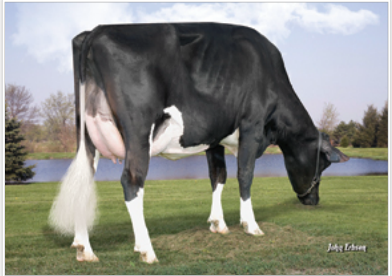
Milbrofar Toro 4099