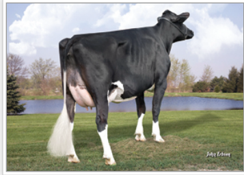
Milbrofar Toro 4099